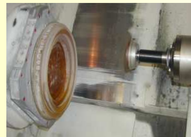
Grinding spindle 20000 rpm , 15 kw

High Gain supplies main machine spindles for milling, routing and grinding plus attachment plug and go spindles for existing milling machines and machining centres.