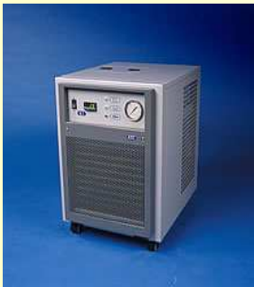
Chiller system for electro spindle