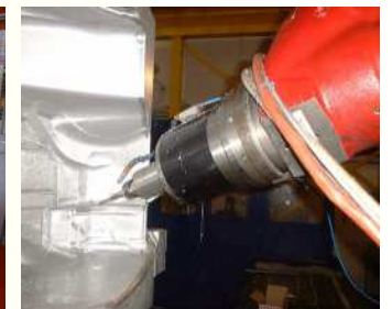
12 kw, 24000 rpm plug in spindle