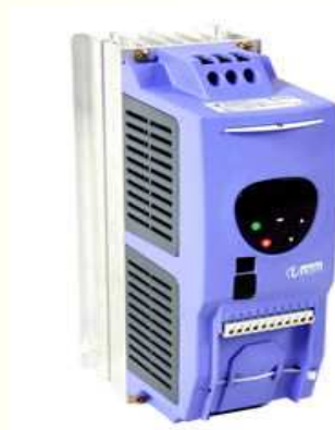
Invertex spindle drive