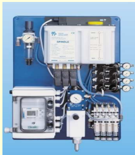
Air oil lubrication system